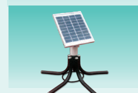
Solar Panel with Stand